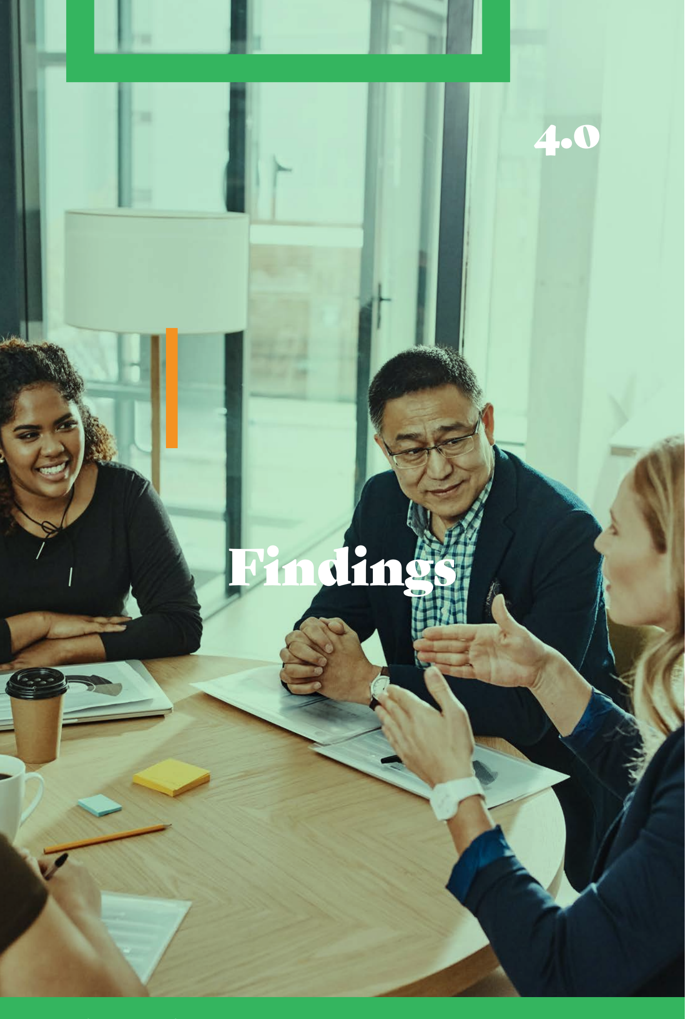
Asian-Australian Diaspora Philanthropy