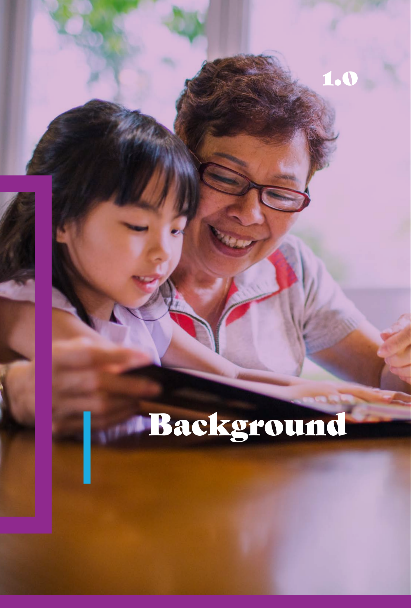
Asian-Australian Diaspora Philanthropy