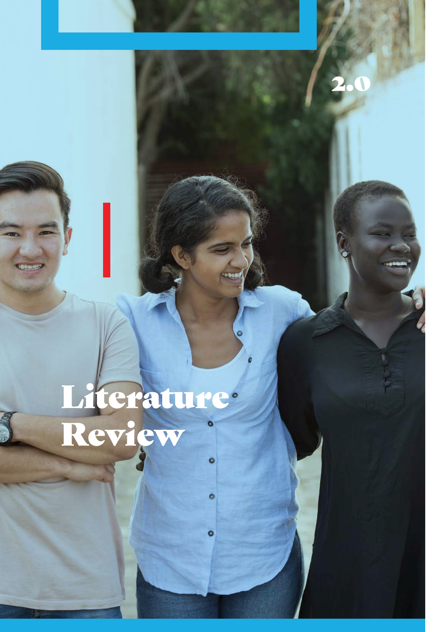
Asian-Australian Diaspora Philanthropy