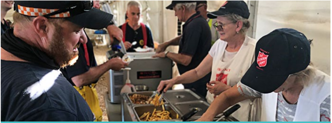
Ritchies continues to support The Salvation Army Emergency Services teams.