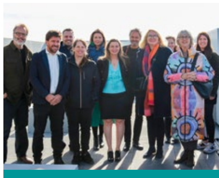
Affordable Housing Challenge: Town Hall Avenue site meeting.