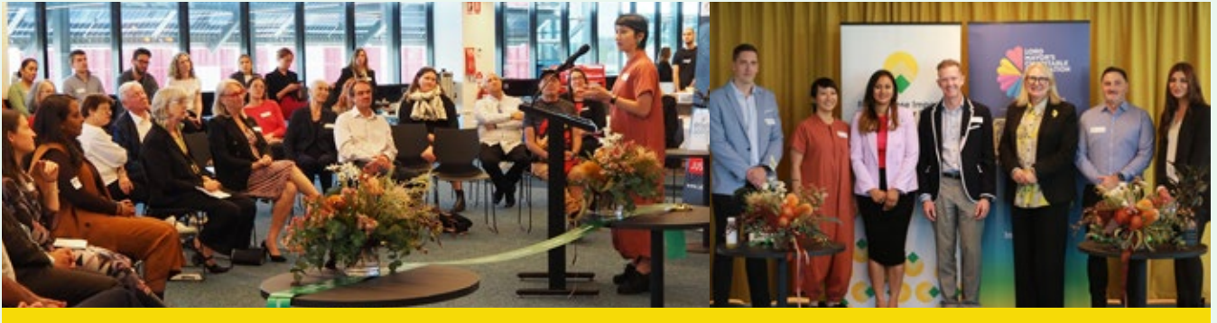
Opening celebrations at the new For Purpose Impact Accelerator Hub.