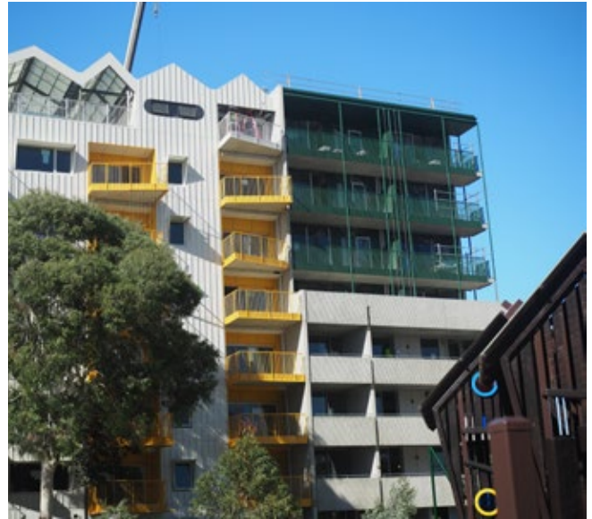
Lord Mayor's Charitable Foundation is supporting affordable projects across Greater Melbourne.

The compelling value of social and affordable housing can now be quantified, thanks to an Australian first calculator that estimates wider social, economic and environmental benefit.