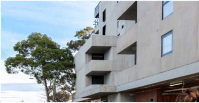
Lord Mayor's Charitable Foundation is supporting Thorne Harbour Health (THH) and Housing Choices Australia (HCA).

Lord Mayor's Charitable Foundation's first Affordable Housing Challenge project, a 40-unit development in Preston, is now complete. In an innovative first, it will also see the development of a social services partnership between Thorne Harbour Health (THH) and Housing Choices Australia (HCA) to provide Australia's first LGBTIQ+ focused social housing project.