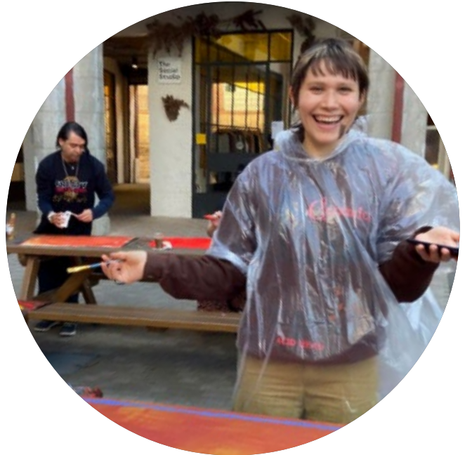
NAIDOC banner printing, at Blak Pearl Studio

Blak Pearl Studio is a creative space for Aboriginal and Torres Strait Islander peoples located in Fitzroy at the Belgium Ave Neighbourhood House. It is an important community studio that provides a unique space for cultural and artistic practice, and provides an opportunity for community connection and engagement, particularly for Aboriginal peoples who are experiencing hardship and disconnection.