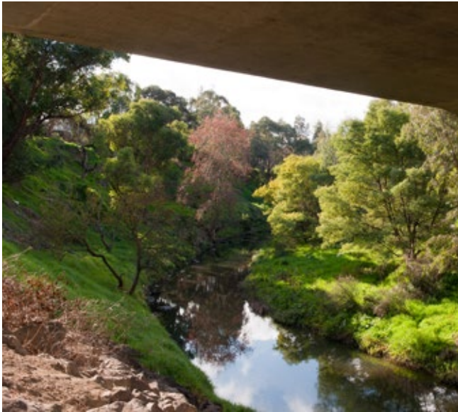
Merri Creek, near Abbotsford.

Unlocking interconnected corridors of green space in densely populated areas around Melbourne is the focus of a new partnership project with The University of Melbourne and not-for-profit design practice, OFFICE.