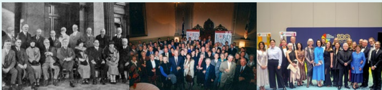
Executive Council 1923; 75th Anniversary Celebrations 1998; Centenary Celebrations 2023

As we commemorate our centenary, we warmly invite you to join our story by contributing your cherished memories and events about Lord Mayor's Charitable Foundation in 100 words or less.