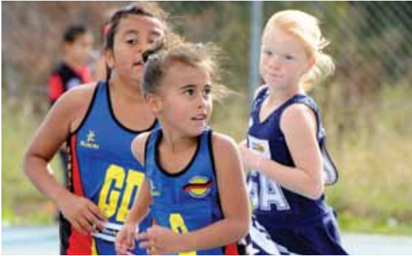
Above: Players from the Rumbalara Football Netball Club.