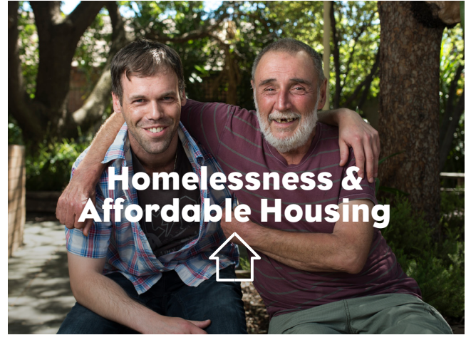
Increasing the supply of affordable housing and preventing homelessness through early intervention initiatives.