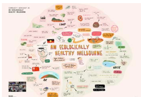
Online workshop discussion.

culture, full of life, affordable, sustainable, collaborative and enabled.