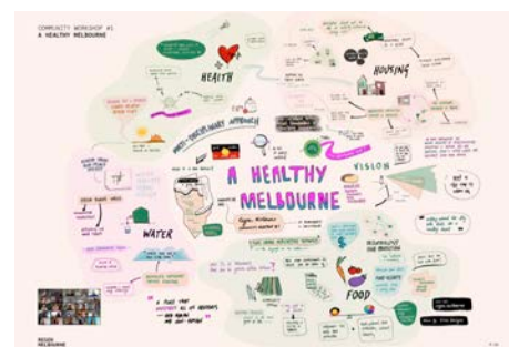
Online workshop discussion