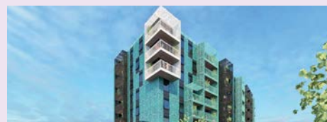
Launch Housing, Artists impression of the new Supportive Housing for Families development in Dandenong.

Located in Dandenong, it will be one of Australia's first supportive housing initiatives for families. It aims to provide long-term affordable housing for women