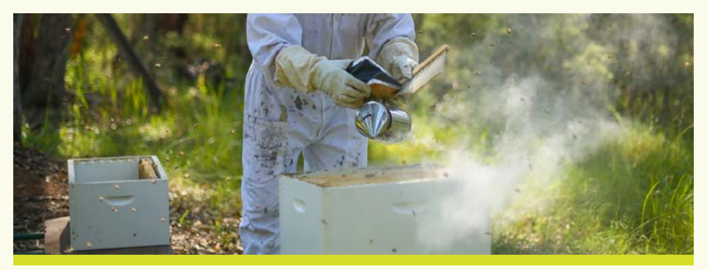
Sweet Justice beekeeping training is helping to increase the number of beekeepers in Victoria.