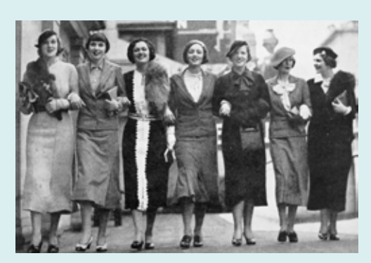
1935 Queens of the Carnival fundraising for Melbourne's public hospitals and charities.