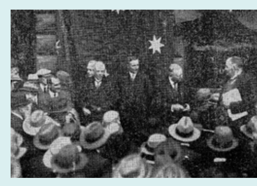
Opening of The Lord Mayor's Fund for Metropolitan Hospitals and Charities in 1923 to provide fundraising and grants in support of public hospitals.

You are invited to learn more about the range of giving options we provide our donor community from individual giving to collective giving and bequests. We hope you will join us as part of a future legacy for Melbourne.