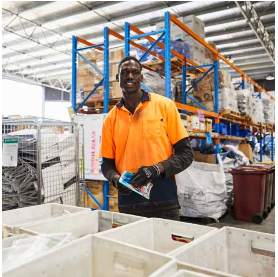
Green Collect

From reducing homelessness to creating employment opportunities for young people, to tackling the effects of climate change, the social enterprise sector is a major contributor to the health and wellbeing of communities throughout Melbourne.