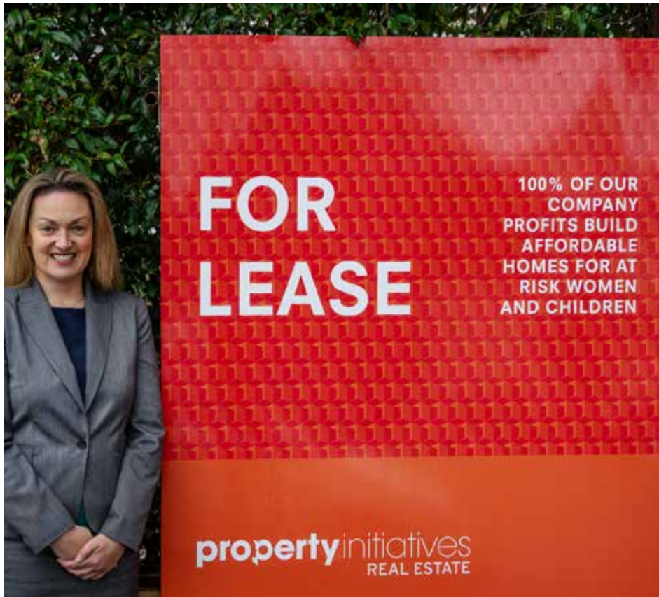
Women's Property Initiatives