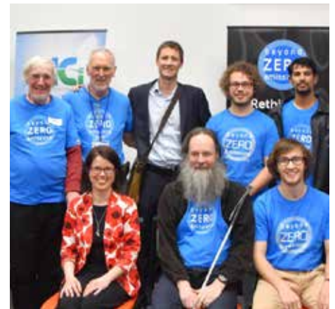
Beyond Zero Emissions

To learn more, visit: facebook/indigopower