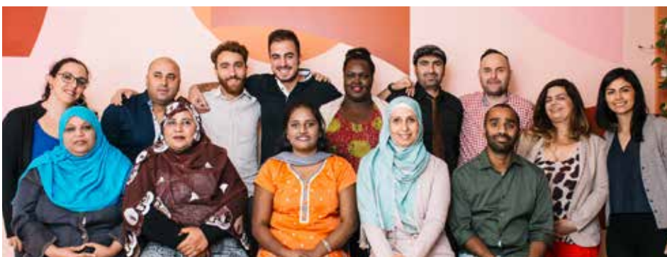
Free to Feed