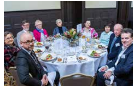
Swanson Society Lunch, 2019