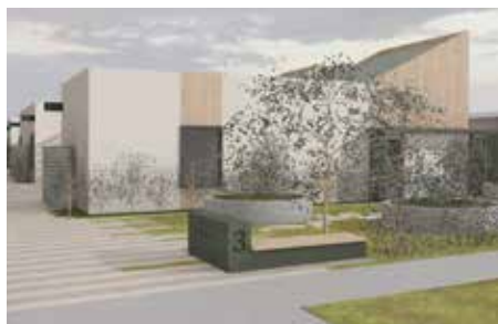
Artist Impression, Women's Property Initiatives

To learn more, visit: wpi.org.au/property-initiatives-real-estate