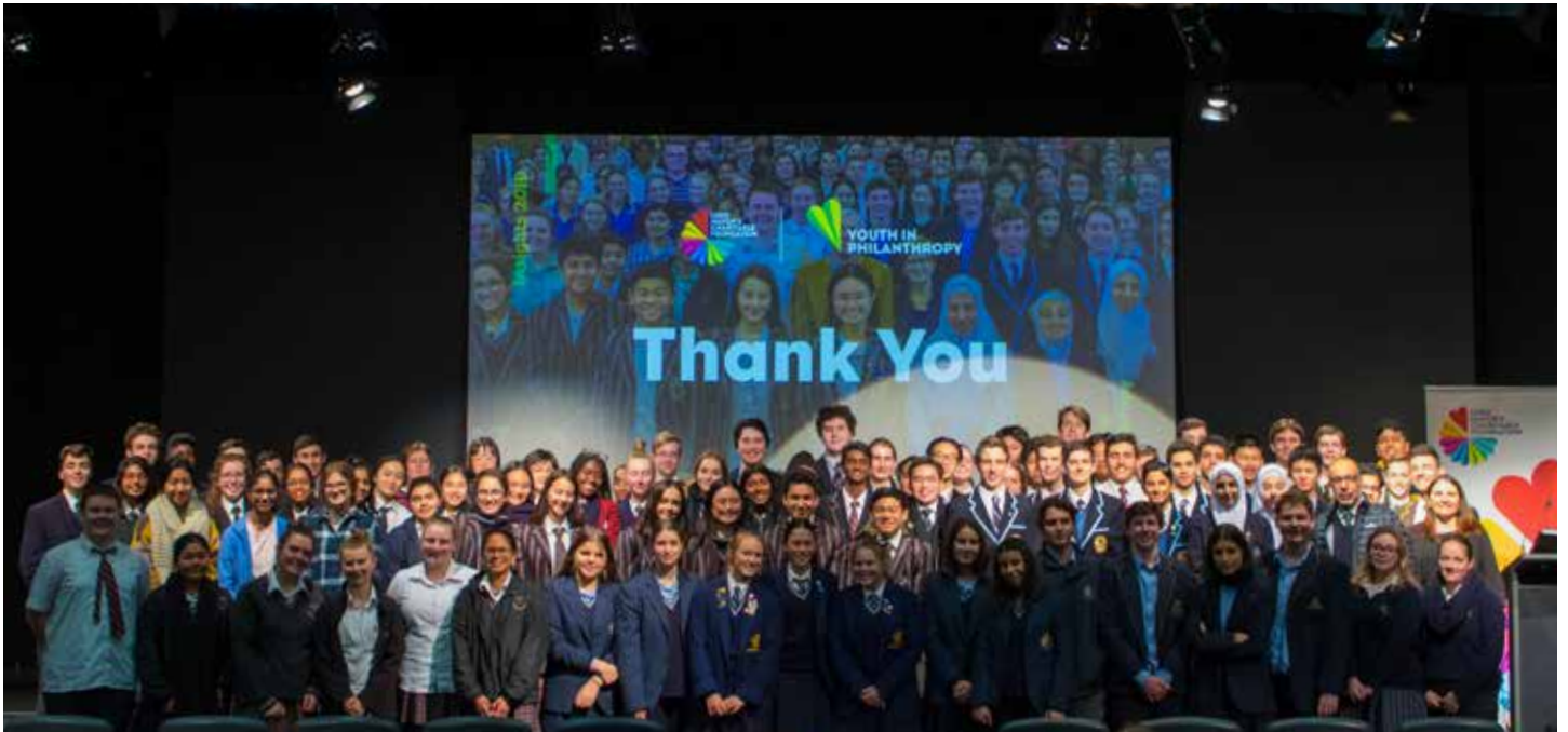
Youth in Philanthropy Insights, 2019