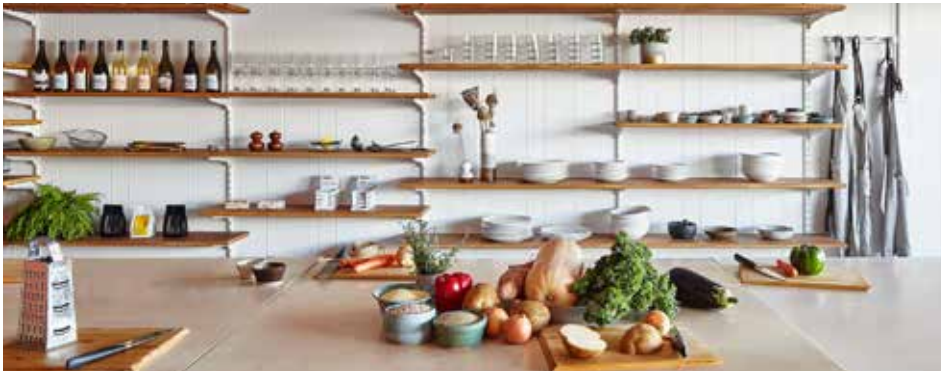
Free to Feed