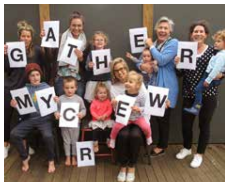
Gather My Crew