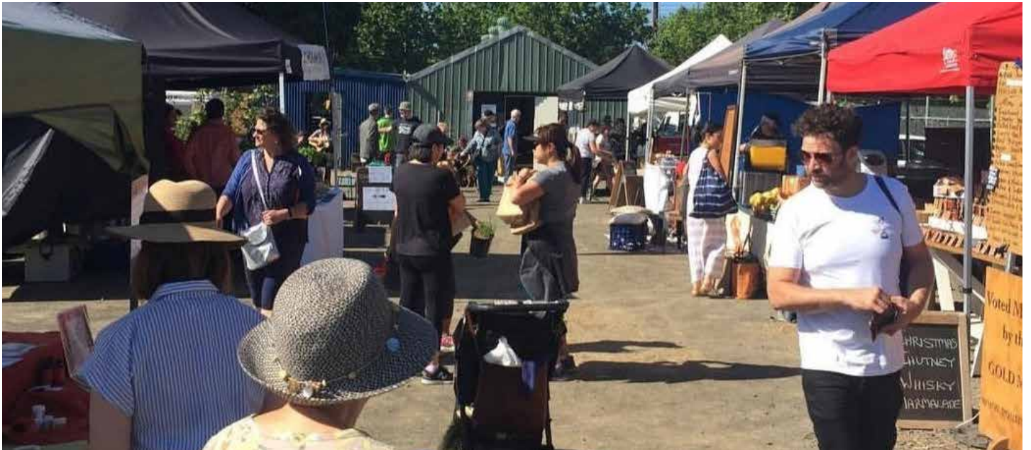
Alphington Farmers Markets attracts over 1500 patrons every Sunday morning