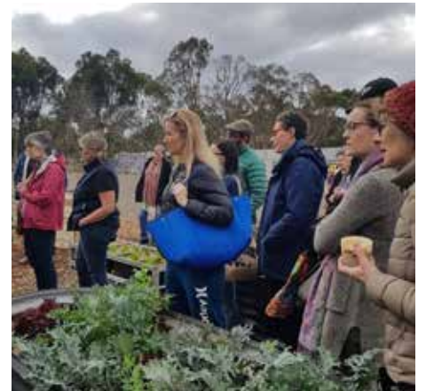
Participants learn about the urban agriculture activities on site at the Melbourne Food Hub Open Day in July

To learn more, visit: melbournefoodhub.org.au