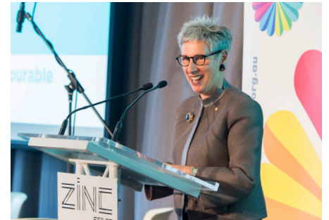
Her Excellency the Honourable Linda Dessau AC Governor of Victoria

Over 250 donors, supporters, friends and grant partners of Lord Mayor's Charitable Foundation celebrated community philanthropy at the Foundation's annual Inspiring Philanthropy Celebration. This year Her Excellency the Honourable Linda Dessau AC Governor of Victoria was the guest orator and spoke about Melbourne's history as a leading philanthropic city, highlighting the Alfred Felton bequest, Churchill Fellowship and the inspiring Dame Elisabeth Murdoch.