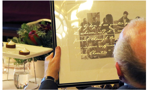
Appreciation gift presented to Swanson Society members, The Swanson Society Dinner 2017