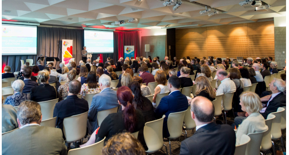
Inspiring Philanthropy Celebration 2017

Over 250 donors, supporters, friends and grant partners of Lord Mayor's Charitable Foundation celebrated community philanthropy at the Foundation's annual Inspiring Philanthropy Celebration. This year Her Excellency the Honourable Linda Dessau AC Governor of Victoria was the guest orator and spoke about Melbourne's history as a leading philanthropic city, highlighting the Alfred Felton bequest, Churchill Fellowship and the inspiring Dame Elisabeth Murdoch.