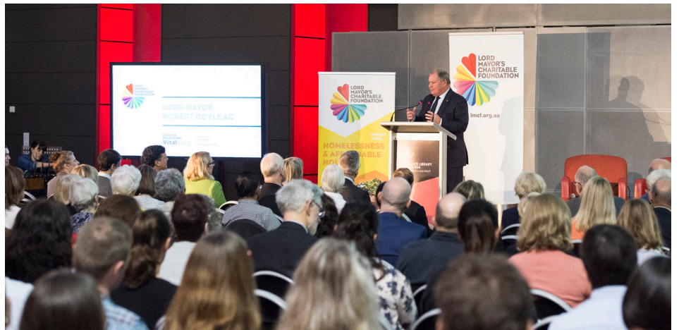
The Right Honourable the Lord Mayor Robert Doyle AC