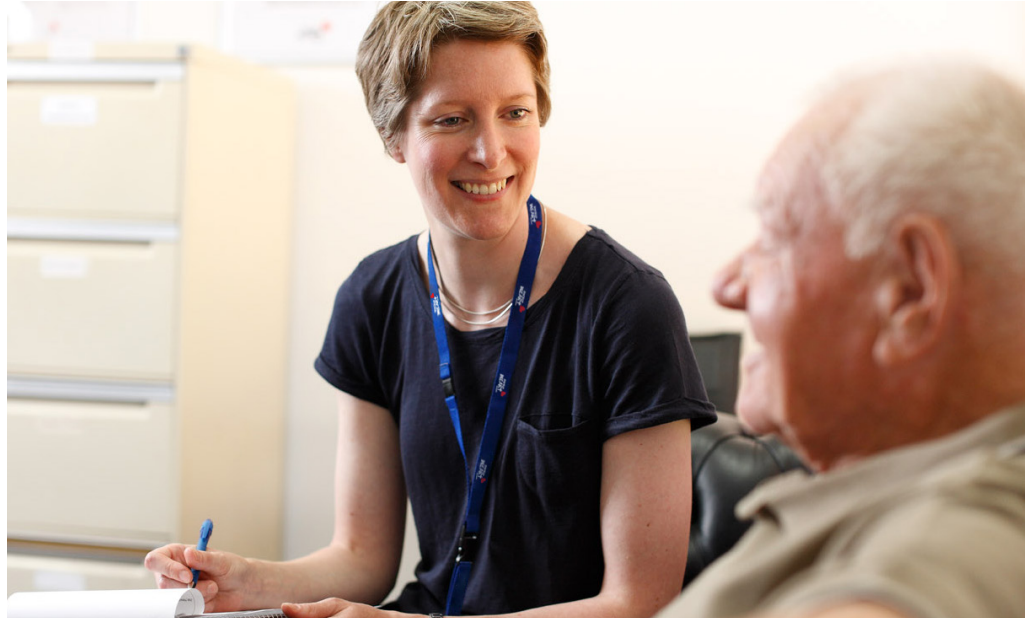
Sacred Heart Mission

"Ensuring that older people living in community housing are supported during this new care system transition."