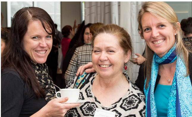
Images: Guests at Inspiring Philanthropy events.